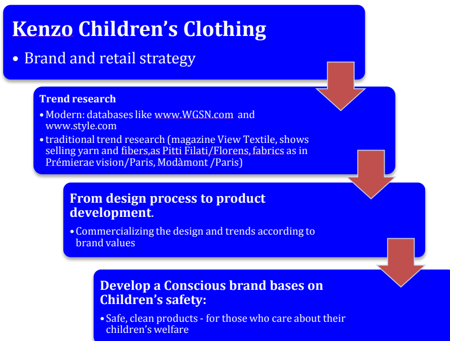
Exhibit 4. Integrative case studies 5-8.