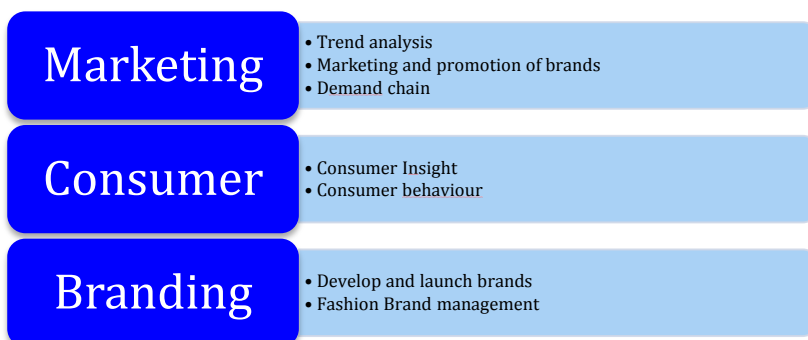
Exhibit 1: BraM contents.

The contents are summarized in the following exhibit (see below)