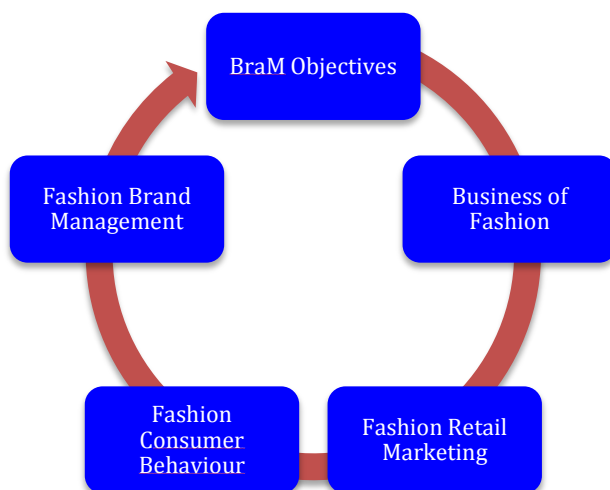
Exhibit 2. Basic modules and sequence.

The setup and the sequence are illustrated in exhibit 2 below.